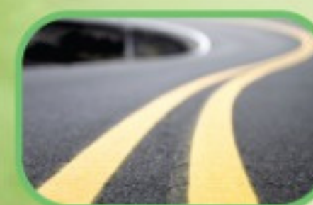
ASPHALT ROAD / TAR ROAD