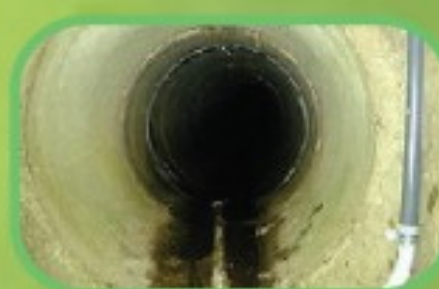
UNDERGROUND SWAGE & CC DRAINAGES