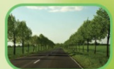
ROAD SIDE PLANTATION TREES