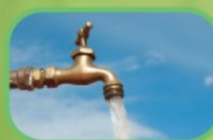
INDIVIDUAL WATER CONNECTION