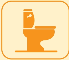
STP and activated sludge process.