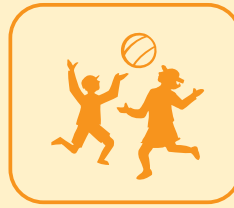
Kids play area