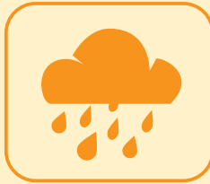
Rain water harvesting