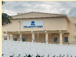
TATA Advanced Systems