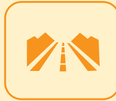
30ft & 40ft RCC Wide road