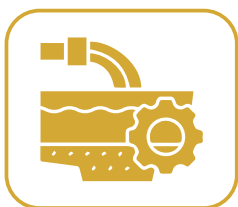
STP and activated sludge process.