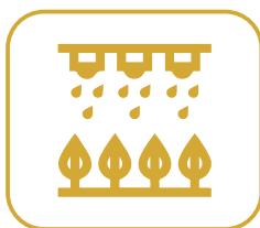
Rain water harvesting