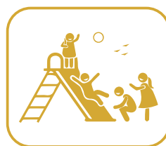
Kids play area