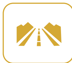
30ft & 50ft RCC Wide road